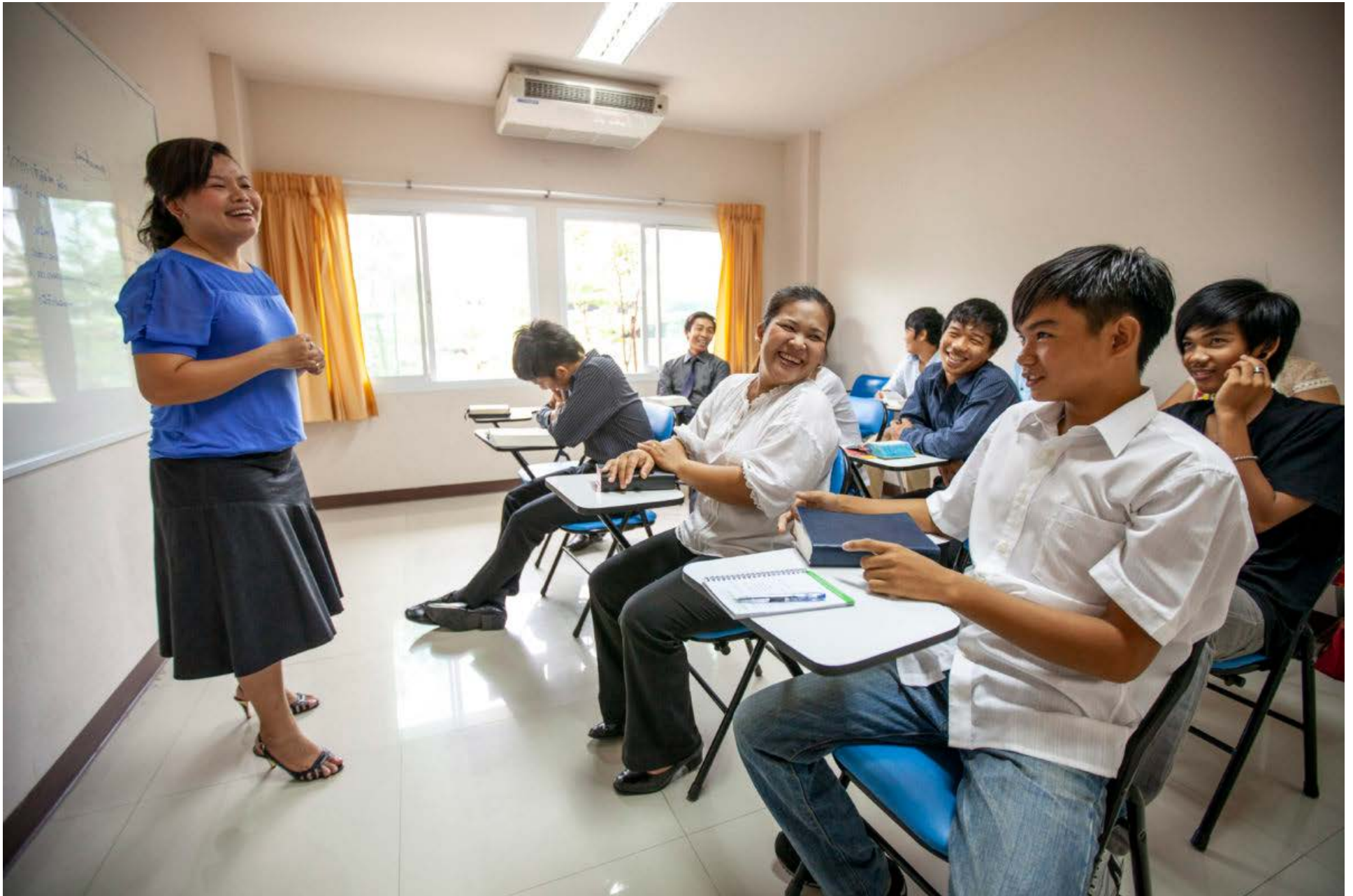
University students learning about the gospel in a new believers' class.