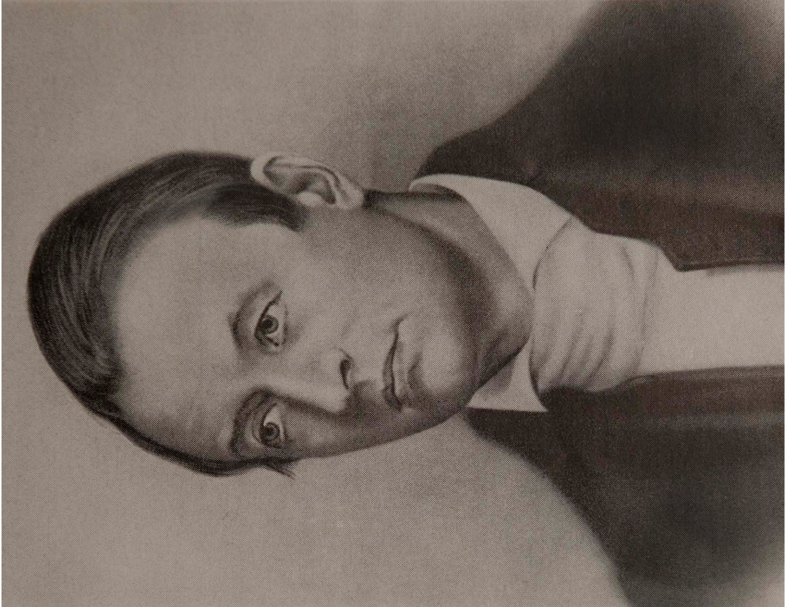
Adoniram Judson (1788–1850)