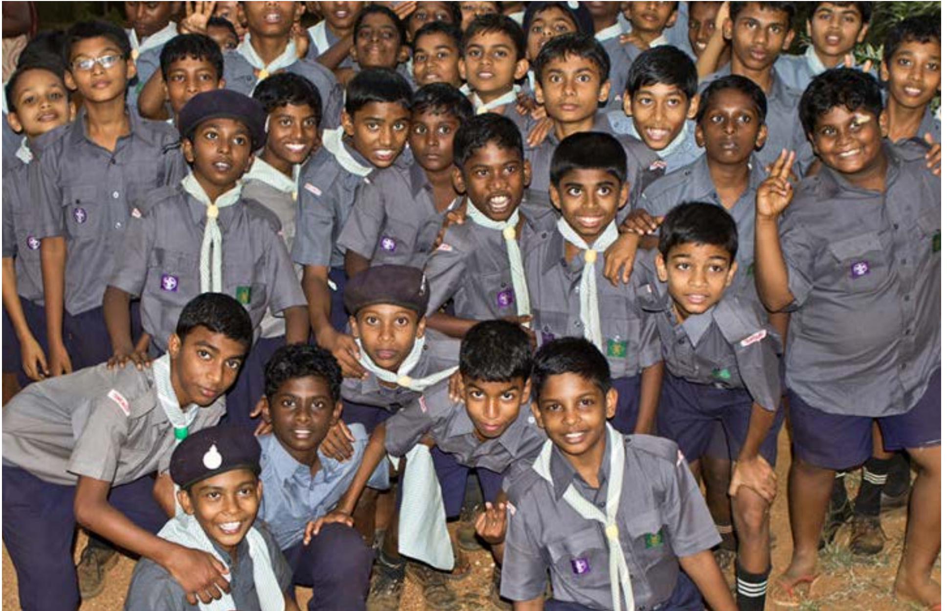
Boys at the Santhosha Vidhyalaya school. The boarding school develops the skills of children from across the country to be contributing members of their communities. The school currently has children who speak 13 different languages, representing 26 out of the 32 states of India.