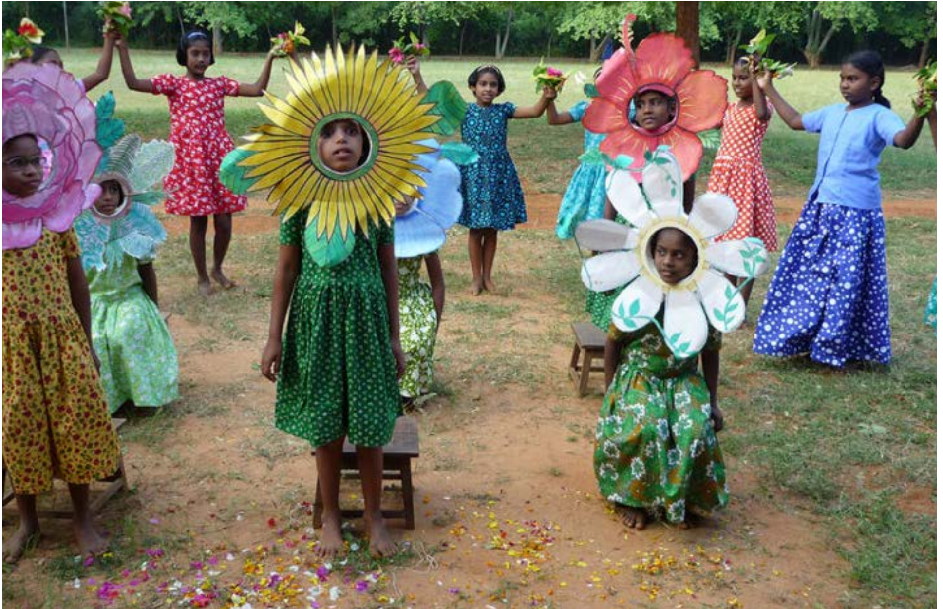
Children perform one of Amma's nature songs.