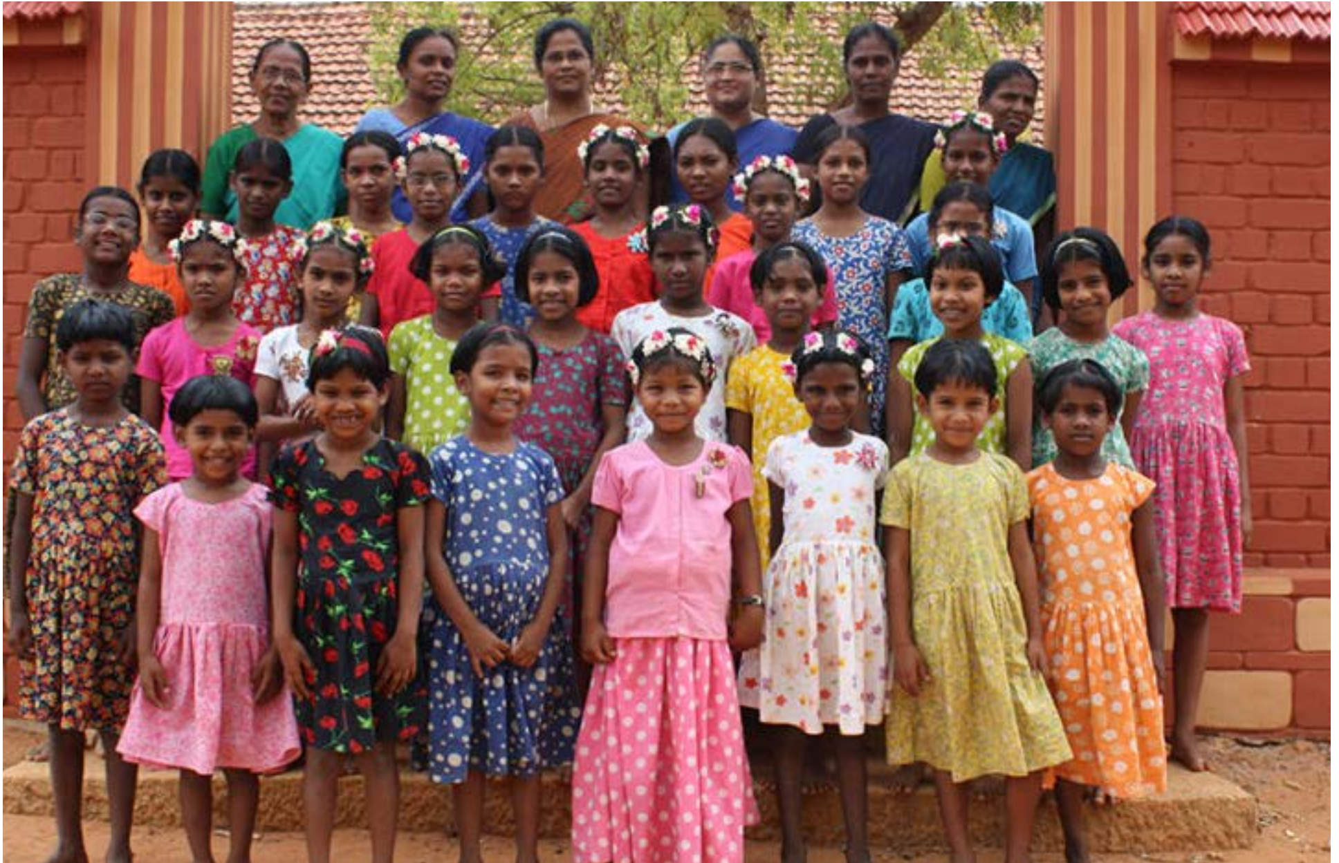
Students and their teachers at the Jeevalaya preparatory school. The school helps children who have just joined the children's home.