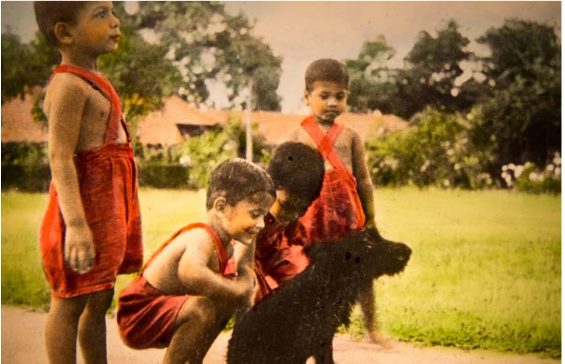
Children play with Amma's dog.