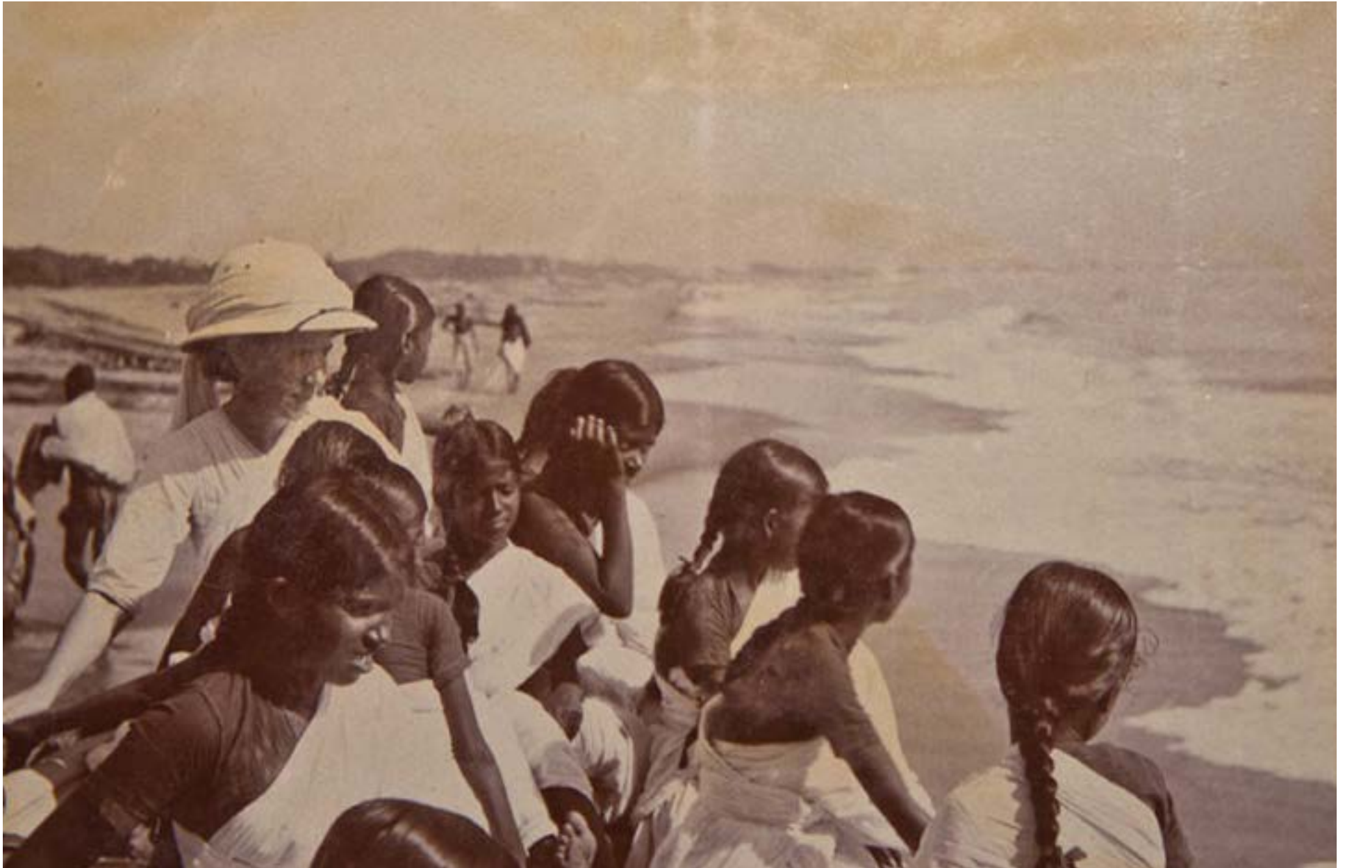
Amy Carmichael (“Amma”) with children at Marina Beach