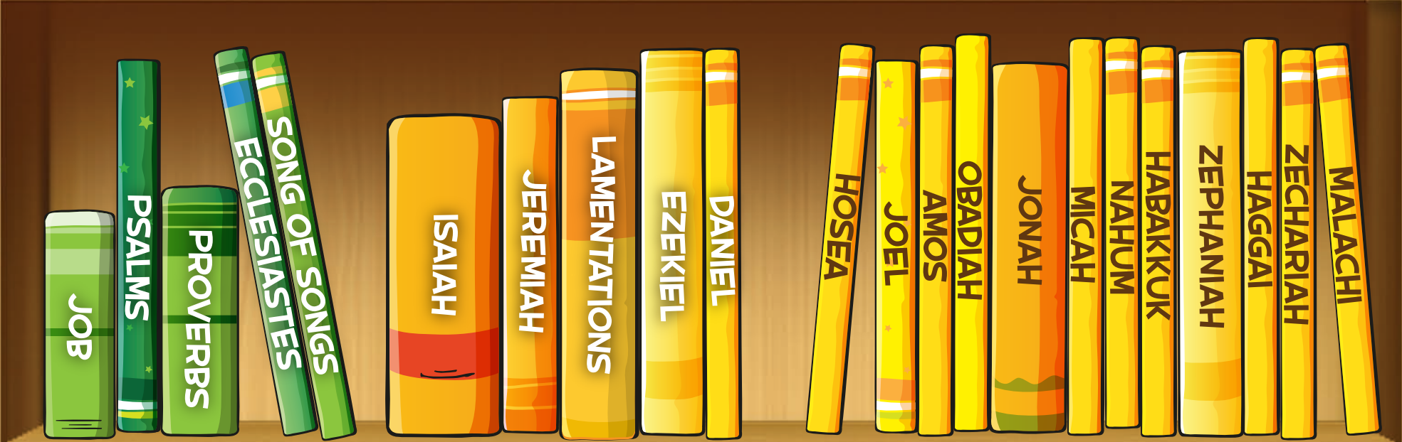
POETRY & WISDOM