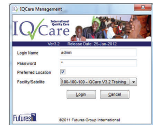
IQCare for administrators and pharmacists (Windows forms)