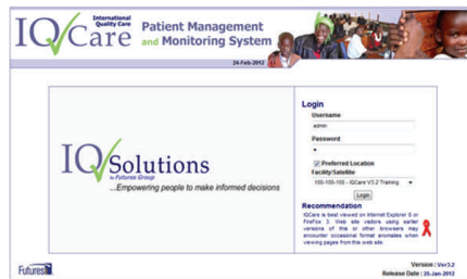
IQCare for clinicians (web browser)