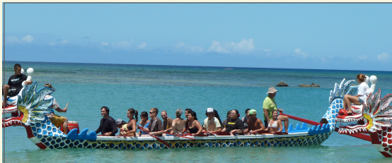
HLC Dragon Boat Crew - students, families, staff, board