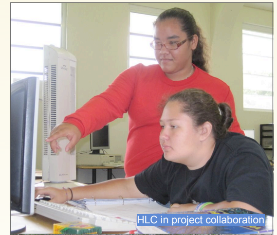
HLC in project collaboration

The importance of a lifelong love of learning is emphasized. In collaboration with many community resources, HLC offers students the opportunity to learn in ‘classrooms without walls’- our community-based field labs. Field labs provide students with direct hands-on, applied learning. Students learn concepts dealing with the environment, the sciences, Hawaiian culture, self-sustenance, as well as math, social studies, and language arts. Sites that host HLC’s labs include He‘eia Waipao lo‘i, the Hakipu‘u abupua‘a, and, our greatest resource, the ocean. Since experts in the community facilitate learning at the labs, students find that all members of the community are enlisted in the learning process. Thus, they directly experience a model of lifelong learning with learning and teaching at all ages.