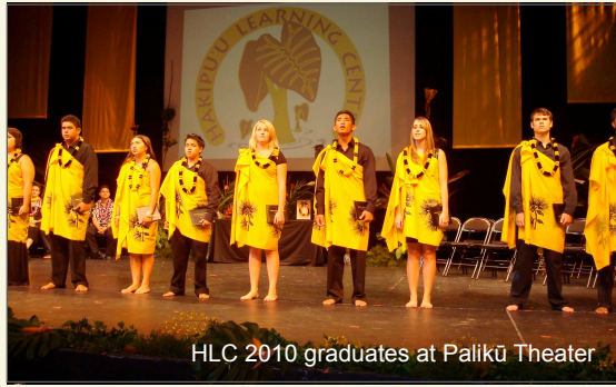
HLC 2010 graduates at Palikū Theater