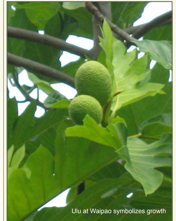
Ulu at Waipao symbolizes growth