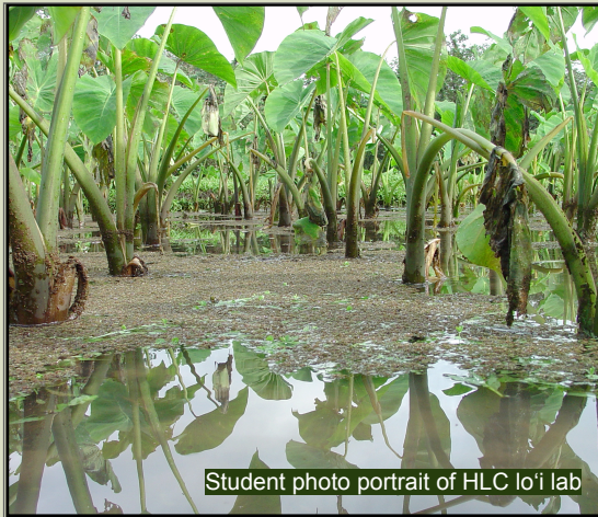
Student photo portrait of HLC lo‘i lab

for his/her record keeping and time management, and apply critical thinking and creative problem solving strategies to be successful. Under the guidance of HLC staff and families, students develop their own Personal Learning Plan to guide their learning path at HLC and throughout their lives. Students are encouraged to work individually, in small groups, and as a school.