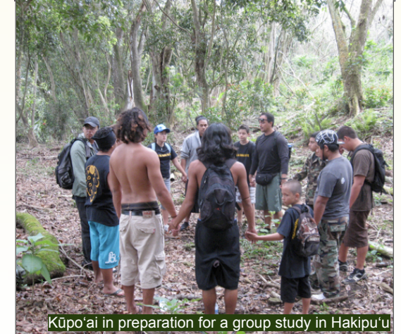
Kūpo‘ai in preparation for a group study in Hakipu‘u