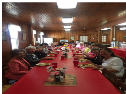
Lunch-time at the PW Retreat at Salem Camp Ground

Members and Friends met on Saturday, April 14, 2016 for this Retreat. The program included enjoyable ice-breakers, a beautiful worship service, time for quiet meditation, great fellowship, and a delicious lunch prepared by the Salem Hotel Chef.