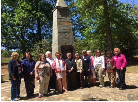
Circle Members pause before the Vaughn Memorial at Salem Camp Ground

Later, during a leisurely stroll within the Camp Grounds, the group visited The Vaughn Memorial Garden.