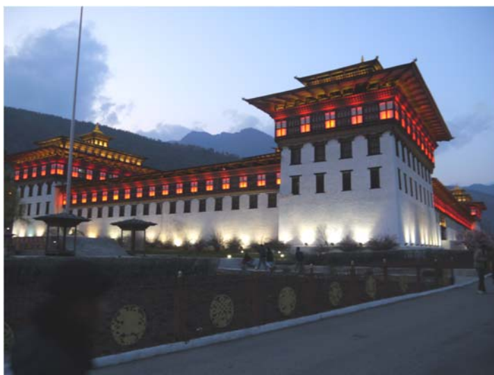
The typical architecture of a Dzong.

I've stood there several times, just across the street from one of their massive, ornately carved gates that are painted with symbolic dragons. They mark the entrance to the start of their kingdom and to the foot hills of the Himalayas beyond. It does us good to stand in needy places like this and consider the plight of the lost and dying souls just beyond our present reach. It does us well to stand before such walls and gates and soberly consider the converts that are persecuted by their own families—the Christians who have been imprisoned for sharing their faith, and the possibility of the countless stories we have not yet even heard. Bhutan is such a place as this; it's a closed country in a little known corner of the world with their own tales of