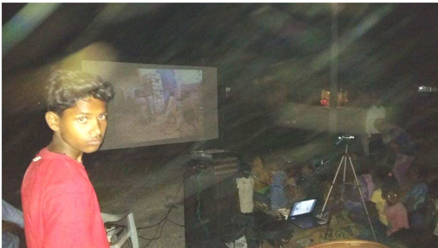
An outdoor showing of the Jesus Film in the local language. If you look carefully you can see the projector on the tripod and barely see the crowd through the darkness. The low speed photo shows the trail of the white shirt worn by a man looking for a better view.