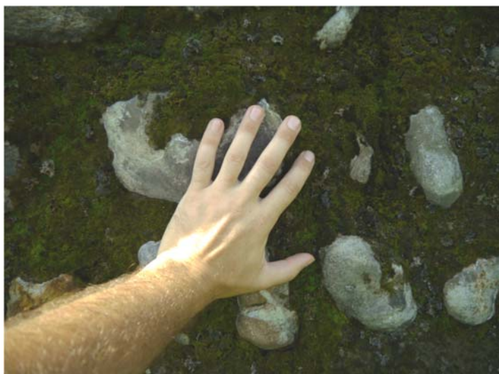
Touching the moss covered, stone wall that separates Bhutan from India.

out first hand if there are any believers there; and if not, how we can help get the Gospel to them. Then we come back and create a full magazine report and video presentation to inform churches about opportunities for reaching these forgotten or fearful places for Christ. Bhutan was our first venture, and we traveled along it's border as well as through several cities and rural locations inside the country.