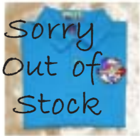
LSCC Club Shirt Short sleeved S, M, L, XL, XXL A. Polo $30