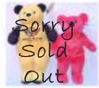
Corvette Beanie Bears Approx. 10" Yellow/Black or Red O. $10

Personalize shirts and jackets. Have your name or initials embroidered for only $5. Prices subject to change without notice.