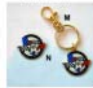
Enamel Key Chain M. $5 Enamel Lapel Pin N. $3