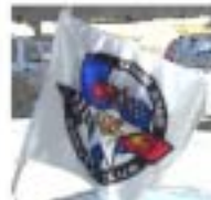
Window Flag L. $10