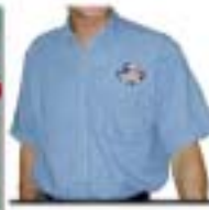
LSCC Denim Shirt S, M, L, XL, XXL ESL. Sleeveless $30 ESS. Short Sleeves $31 ELS. Long Sleeves $32