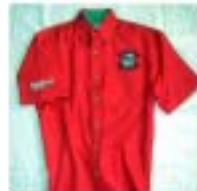
LSCC 20th Anniversary red denim shirt S, M, L, XL, XXL D. $35