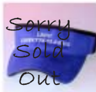
Sun Visor Blue or White K. $15