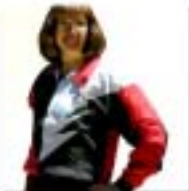
LSCC Jacket S, M, L, XL, XXL C. $55