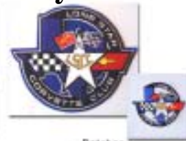
Patches F. Small 3" $3 G. Large 12" Chinelle $40 Specify background color: blue, red, yellow, black or white while supplies last.