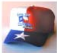
Club caps in assorted styles and sizes. Specify color and style preference J. $15