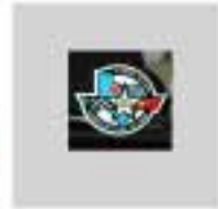
Window Decal Specify Inside or Outside H. $3