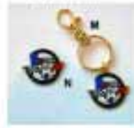
Enamel Key Chain M. $5 Enamel Lapel Pin N. $5