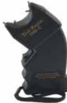
Stun Master $22.00

FREE SHIPPING with $ 50.00 order at: www.STUNNINGPROTECTION.com