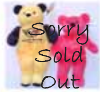
Corvette Beanie Bears Approx. 10" Yellow/Black or Red O. $10

Personalize shirts and jackets. Have your name or initials embroidered for only $5. Prices subject to change without notice.