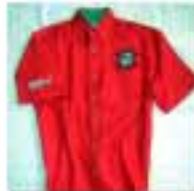
LSCC 20th Anniversary red denim shirt S, M, L, XL, XXL D. $35