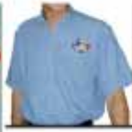
LSCC Denim Shirt S, M, L, XL, XXL E5L Sleeveless $30 E5S Short Sleeves $31 ELS Long Sleeves $32