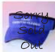
Sun Visor Blue or White K. $15