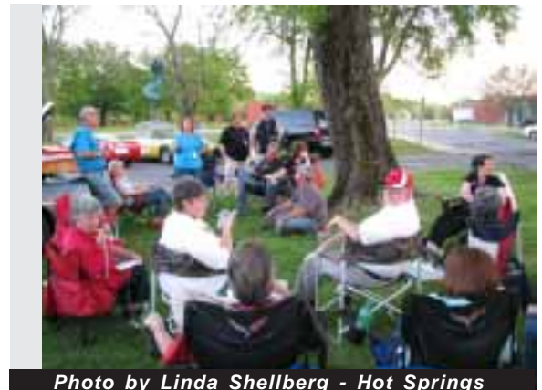
Hot Springs