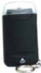
Keychain Alarm/Lite $15.00