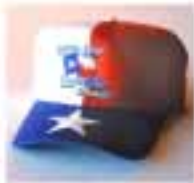
Club caps in assorted styles and sizes. Specify color and style preference J. $15