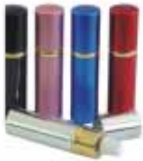
Lipstick Pepper Spray $12.95