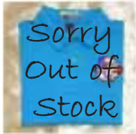
LSCC Club Shirt Short sleeved S, M, L, XL, XXL A. Polo $30