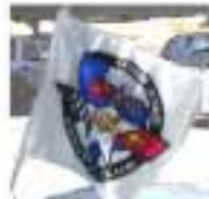
Window Flag L. $10