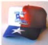
Club caps in assorted styles and sizes. Specify color and style preference J. $15