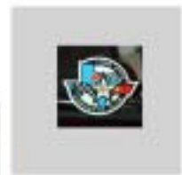
Window Decal Specify Inside or Outside H. $3