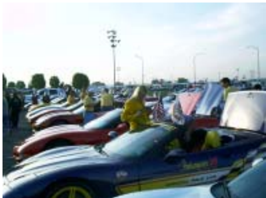
Members line up in the TMS parking lot prior to the parade lap (which actually was 2 full laps around the track)

Following the parade, most participants stayed to enjoy the race.