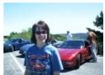
Getting lined up for some photos