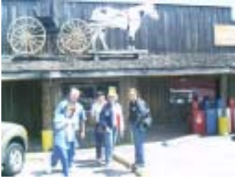
At lunch on the way to Fredericksburg