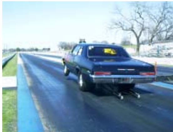
Jimmy O'Neal puts some space between the front tires and the track

Join us back at the Motorplex on October 16 or at one of the races between now and then.