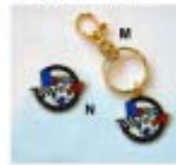
Enamel Key Chain M. $5 Enamel Lapel Pin N. $5