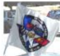
Window Flag L. $10