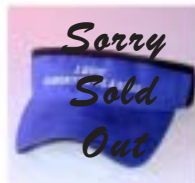
Sun Visor Blue or White K. $15