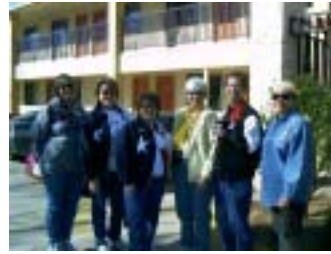
Out in the hotel parking lot before a road trip