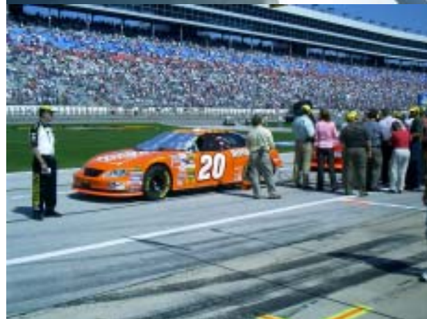
The track allowed participants to visit the pits, here's the #20 Chevrolet