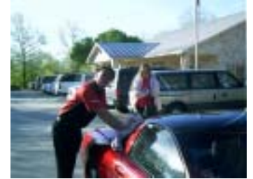
Cleaning up the cars for the trip home