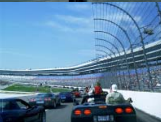
...and coming out of turn 4 onto the front straight