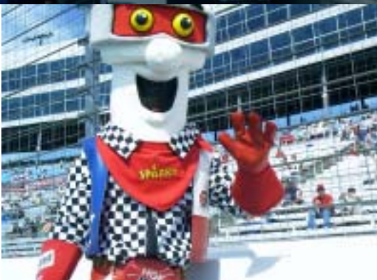
Sparky was out to greet everyone