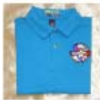
LSCC Club Shirt Short sleeved S, M, L, XL, XXL A. Polo $30