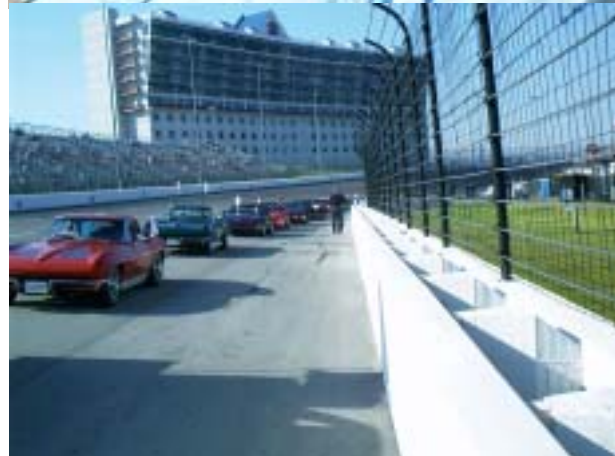
lined up along the back straight of the track...