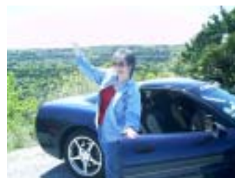
Look at this view!