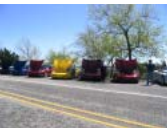
Lined up for a Corvette photo