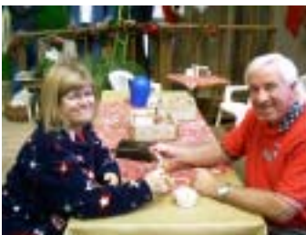
Nothing like sharing a slice of delicious apple pie