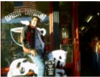
The newsletter editor takes "Old Paint" for a ride