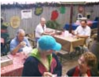
A stop at the Cider Mill in Medina for "everything apple"