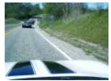
Crossing the Guadalupe River