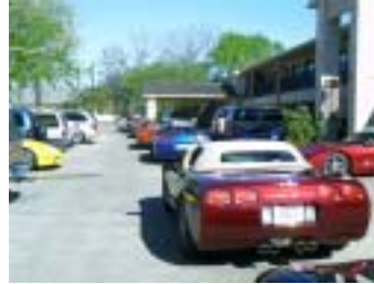
Leaving the hotel for a scenic drive