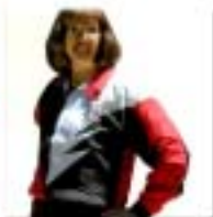
LSCC Jacket S, M, L, XL, XXL C. $55