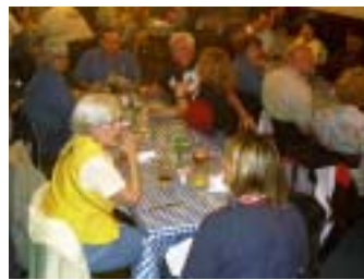
German food and beer at the Aushlander