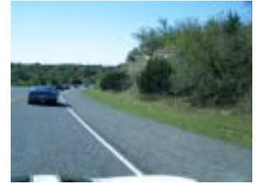
Cruising the beautiful hill country