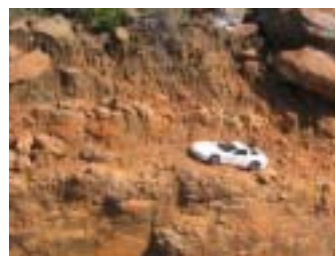
Did I go the wrong way?