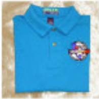
LSCC Club Shirt Short sleeved S, M, L, XL, XXL A. Polo $30