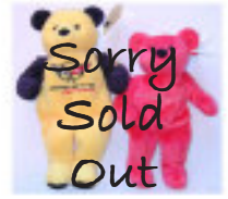
Corvette Beanie Bears Approx. 10" Yellow/Black or Red O. $10

Personalize shirts and jackets. Have your name or initials embroidered for only $5.