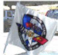
Window Flag L. $10