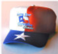
Club caps in assorted styles and sizes. Specify color and style preference J. $15