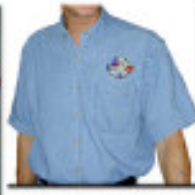
LSCC Denim Shirt S, M, L, XL, XXL ESL. Sleeveless $30 ESS. Short Sleeves $31 ELS. Long Sleeves $32