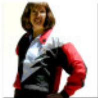
LSCC Jacket S, M, L, XL, XXL C. $55