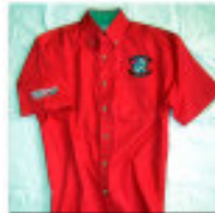
LSCC 20th Anniversary red denim shirt S, M, L, XL, XXL D. $35