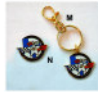
Enamel Key Chain M. $5 Enamel Lapel Pin N. $5