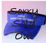
Sun Visor Blue or White K. $15