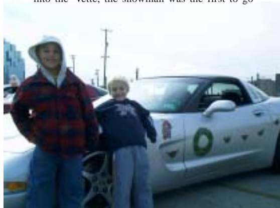
The Corvettes were decorated, the kids were there