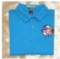
LSCC Club Shirt Short sleeved S, M, L, XL, XXL A. Polo $30