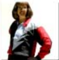
LSCC Jacket S, M, L, XL, XXL C. $55