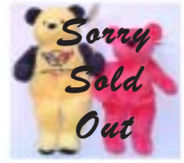
Corvette Beanie Bears Approx. 10" Yellow/Black or Red O. $10

Personalize shirts and jackets. Have your name or initials embroidered for only $5.