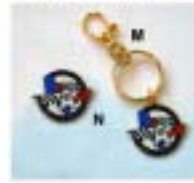
Enamel Key Chain M. $5 Enamel Lapel Pin N. $5