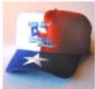
Club caps in assorted styles and sizes. Specify color and style preference J. $15