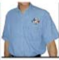
LSCC Denim Shirt S, M, L, XL, XXL ESL. Sleeveless $30 ESS. Short Sleeves $31 ELS. Long Sleeves $32