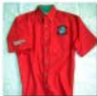
LSCC 20th Anniversary red denim shirt S, M, L, XL, XXL D. $35