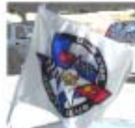
Window Flag L. $10