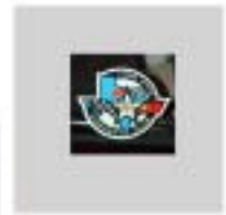
Window Decal Specify Inside or Outside H. $3