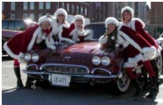
Santa's helpers were all eager to take a ride in this one horse open sleigh