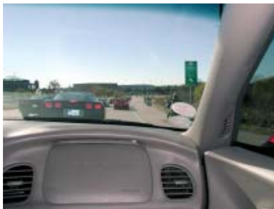
Arriving at the end of the Toy Run