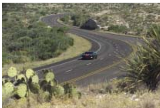
Some of the beautiful roads you will travel during an open road race, at speeds over 100 MPH and NO SPEEDING TICKET!

If you are interested in participating in an open road race for 2005, look for information and sign up at an upcoming meeting or contact Gary Ellsworth who will be happy to help you.