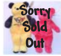
Corvette Beanie Bears Approx. 10" Yellow/Black or Red O. $10

Personalize shirts and jackets. Have your name or initials embroidered for only $5.