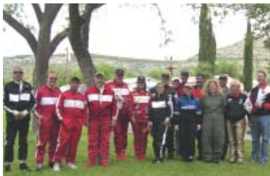
The 2004 LSCC Open Road Racers ....join us for an open road race in 2005, you won't regret it!

We had a great open road racing year and we hope to see more of you give it a try next year.