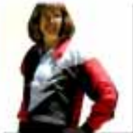
LSCC Jacket S, M, L, XL, XXL C. $55