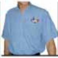
LSCC Denim Shirt S, M, L, XL, XXL E5L Sleeveless $30 E5S Short Sleeves $31 E5L Long Sleeves $32