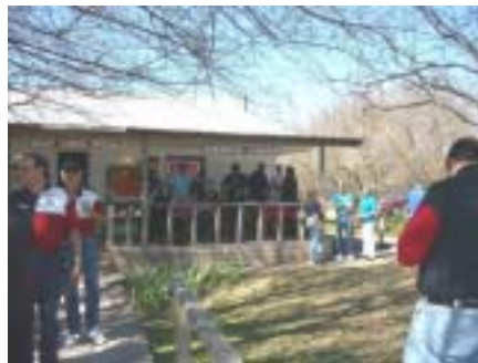
Does that sign say lunch specials?