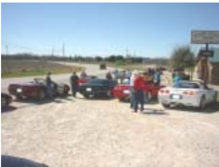
Just one quick pit stop before we get there