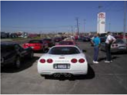
Let the fun begin - about to leave