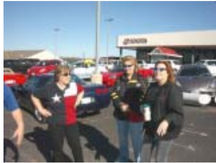
Why do we meet so early?