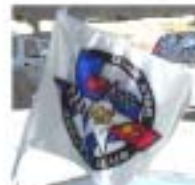
Window Flag L. $10