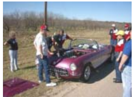
Did you bring the fuel filter? No - did you?