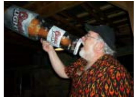
...except of course a BIG beer!