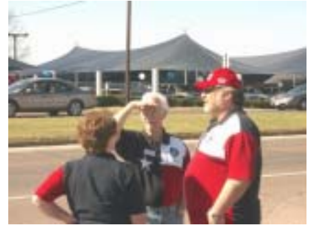
Now where did my group go?