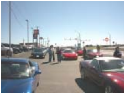
Didn't I qualify for the pole?