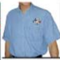
LSCC Denim Shirt S, M, L, XL, XXL ESL. Sleeveless $30 ESS. Short Sleeves $31 ELS. Long Sleeves $32