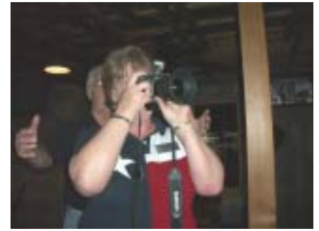
Let me get some pictures for the newsletter!