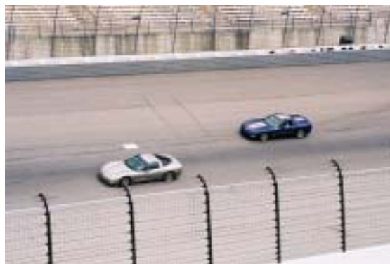
Hot Laps around the Texas Motor Speedway at last years LSCC Classic. With YOUR help we can make this years Classic the best ever!

Remember the next Classic XVI coordinator's meeting will be at 6:30 PM at Joe's Crab Shack I35E and NW HWY on April 19.