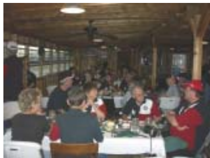
Nothing like a BIG dinner after a busy day...