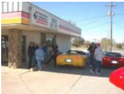
I think we can find a fuel filter here!