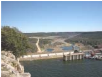
Baever Dam at Possum Kingdom Lake