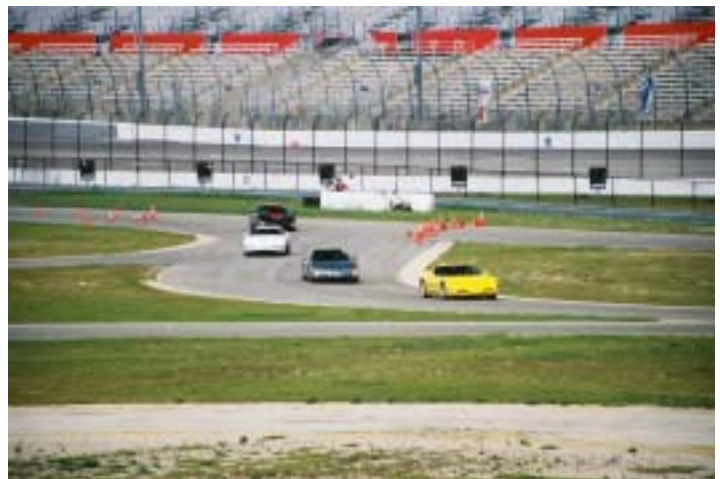
On the Texas Motor Speedway Road Course at last year's Classic XV