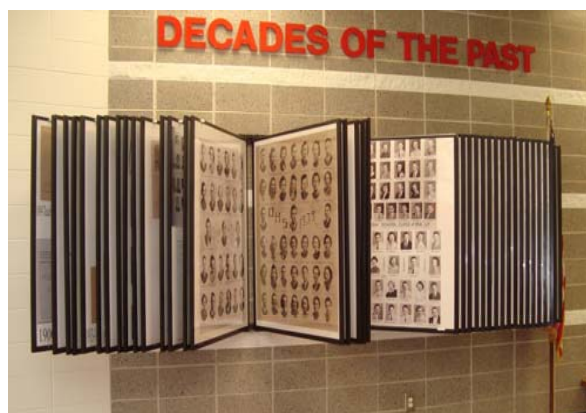
This is what the system will look like when mounted on the wall in the high school commons area.

You can also go online and make your contribution at www.lrfoundation.org