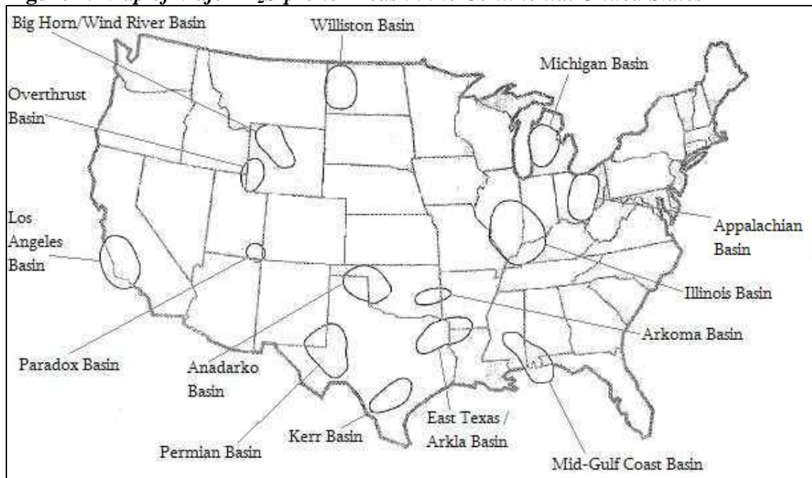
Figure 1. Map of Major H 2 S-prone Areas in the Continental United States 18

percent). 17 Figure 1 illustrates the major H 2 S prone areas in the United States and identifies the basins.