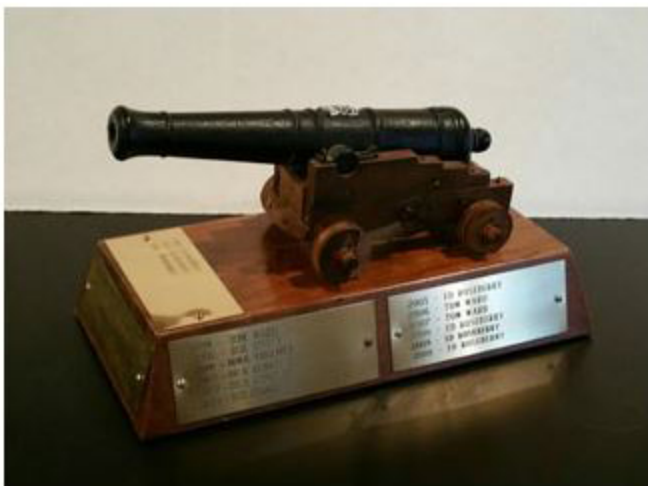
Old Salts Perpetual Cannon Trophy

The award, The "Glockenspiel" Plaque, will be presented in the future to the "Senior Sailor" (the oldest competitor / skipper or crew) to compete in the regatta.