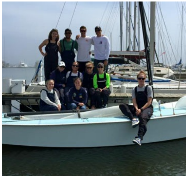
TEAM WISCO at the Mid West Districts