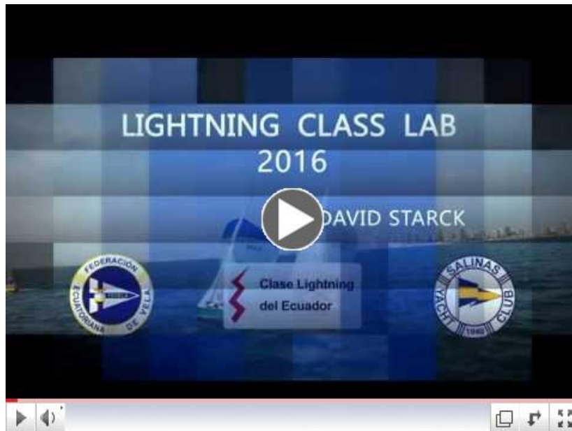
Salinas YC Lightning Lab Intro!