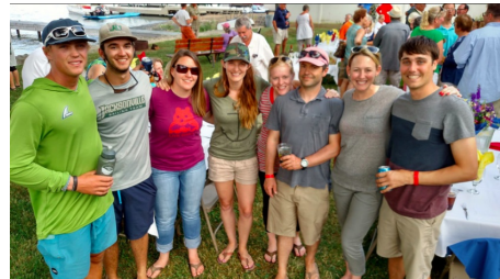
Fleet 52 representing at the Champagne Regatta