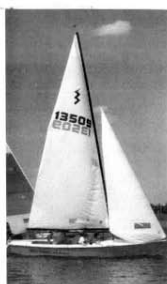
The First Lightning at Fleet 507.

Fleet 507 did not travel to other regattas this year but certainly plan to next year. This year our racing mostly consisted of regular events at our home club including, our Commodore's Cup, Club Championship, and Thursday night races.