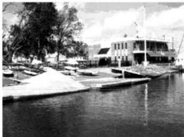
Hampton Yacht Club after Hurricane Isabel.

For 2004, we hope to add 2-3 new boats to the fleet plus offer some series racing during the late spring and early fall.