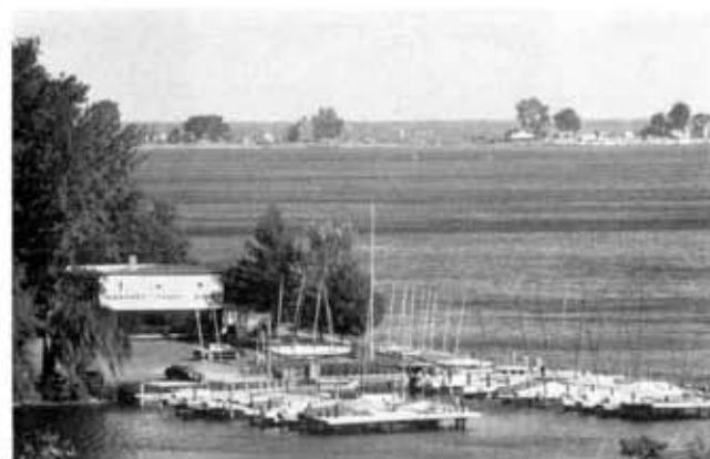
Newport Yacht Club August 14 - 17