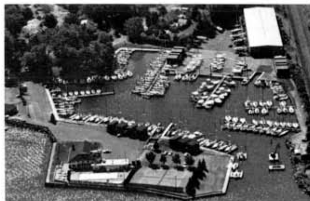
Rochester Yacht Club August 17 - 24