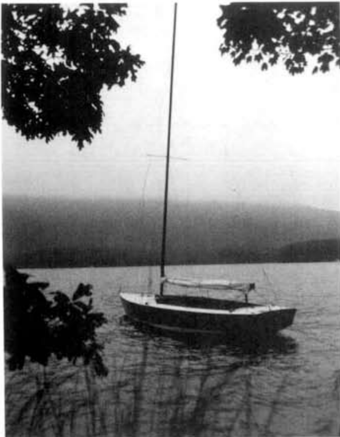
A misty morning — Smith Mtn. Lake, VA