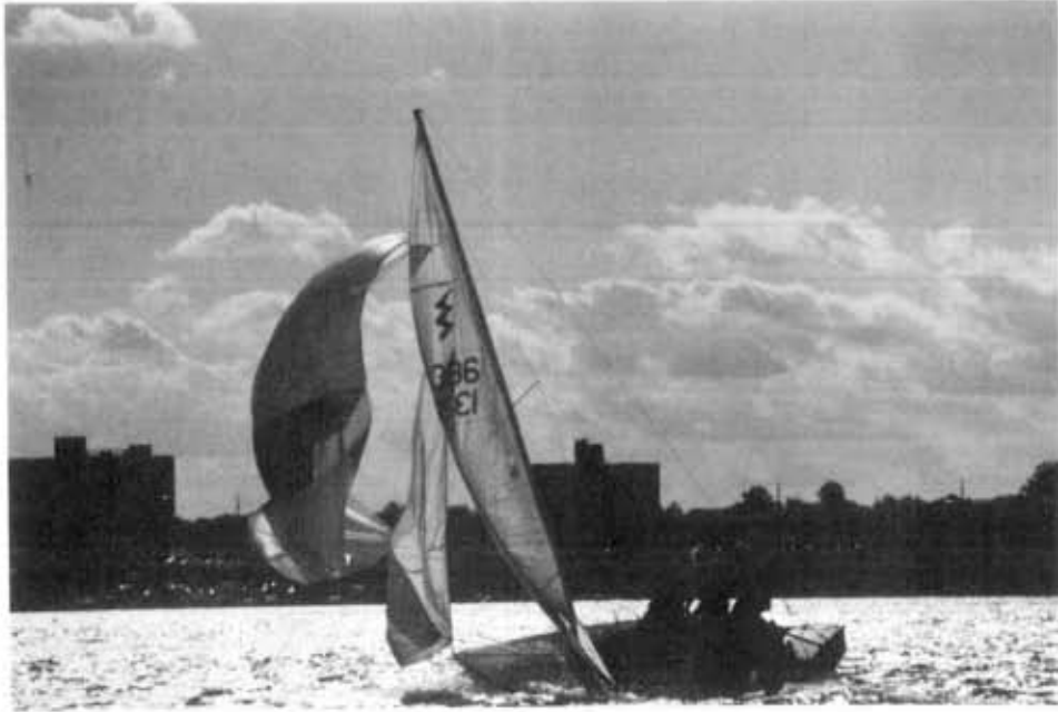
A great spinnaker day — Fleet 11.