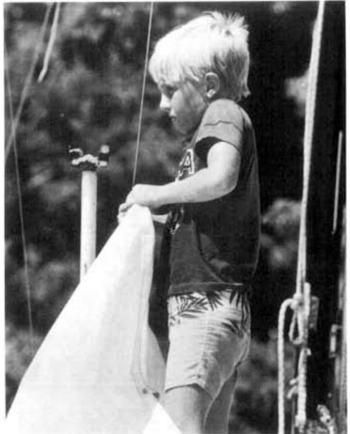
The Perfect Crew