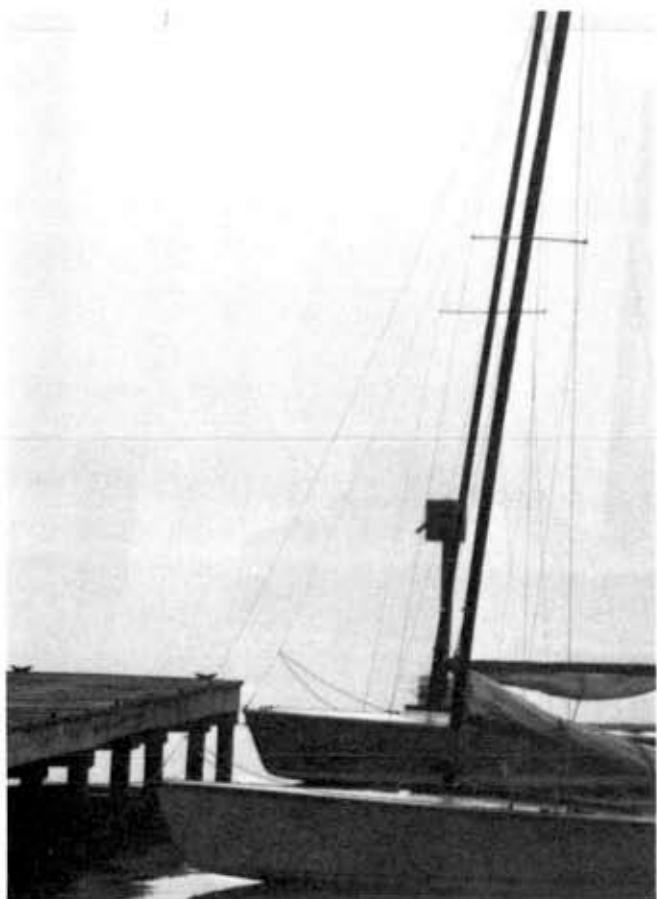
Sunset — Lake Waccamaw, N.C.