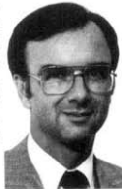
TREASURER & TRUST FUNDS