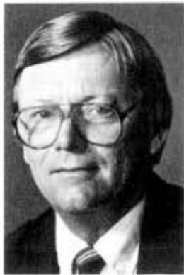
CHIEF MEASURER & VICE