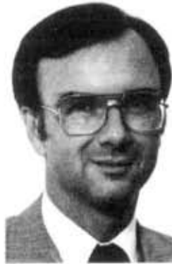
SECRETARY & TRUST FUNDS