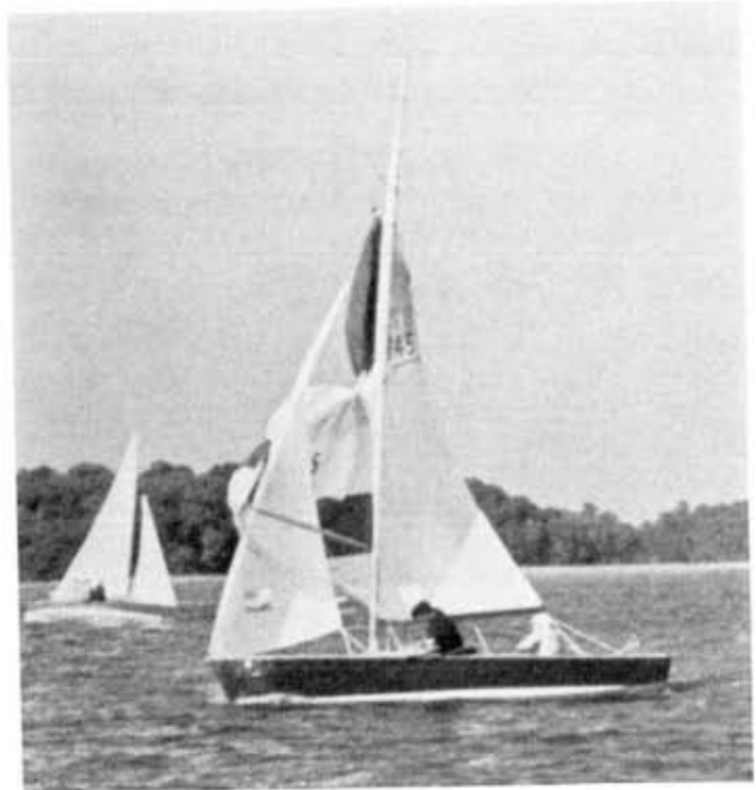
Don Bever: "Well, they got it up fast."

The first practice race was sailed Saturday afternoon