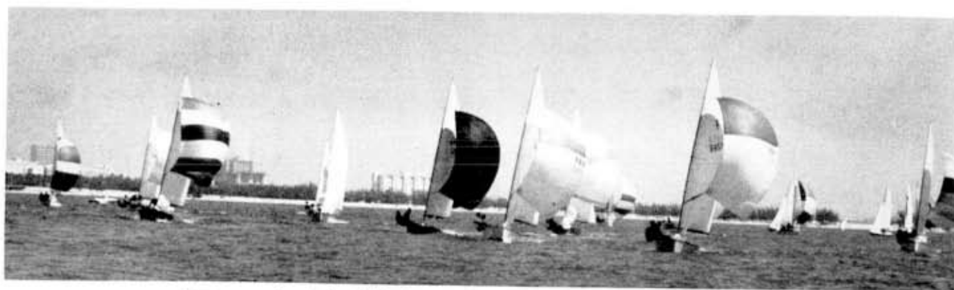
Coming or going (below) Miami was a thrilling windup to a closely contested series.