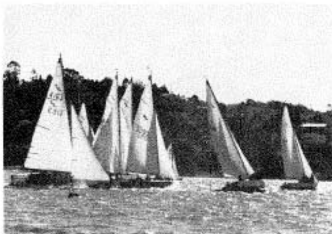
Start of one of the Inter-fleet races Rio vs. Sao Paulo.

from Rio. Each fleet entered four boats and after a series of three close and exciting races Sao Paulo defeated Rio by a small margin of points. This is the first inter-fleet team event sailed in Brazil and it has been arranged that in future this event will be sailed yearly alternatively in Rio and Sao Paulo. This will undoubtedly do much to foster Lightning interest in both centers.