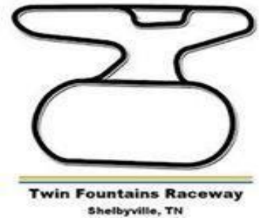
Twin Fountains Raceway Shelbyville, TN