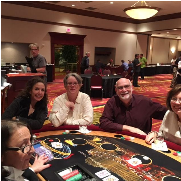
APA Members enjoying Casino Night!