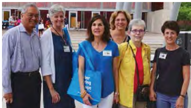
Board members showed our colors in downtown Silver Spring.