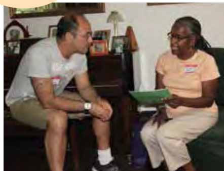
Volunteers practiced role-playing during our required training.