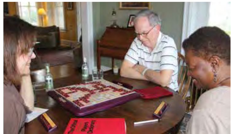
Our Scrabblers have a way with words!