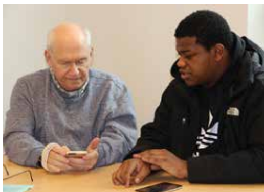
Tech help with teens on MLK Day