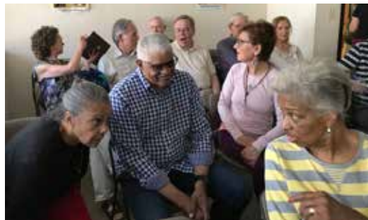
Catching up with friends before a presentation