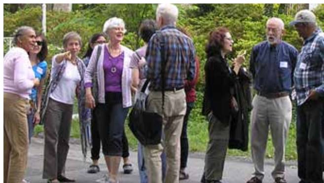
Assembling on a nice spring day for a guided walk