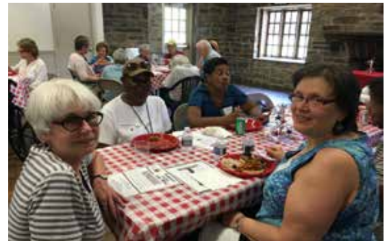
Our summer barbecue was a hot hit