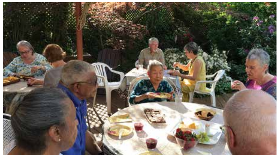
Enjoying old and new friends on a member's patio