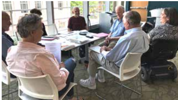
Sharing some favorite poems at a monthly event