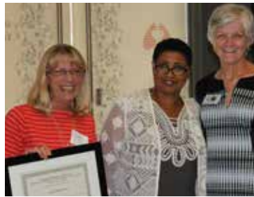
Acknowledging an outstanding volunteer

*Includes home repairs, decluttering, paperwork, shopping, medical note-taking, escorted walks, tech support and more.