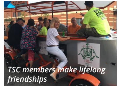
TSC members make lifelong friendships