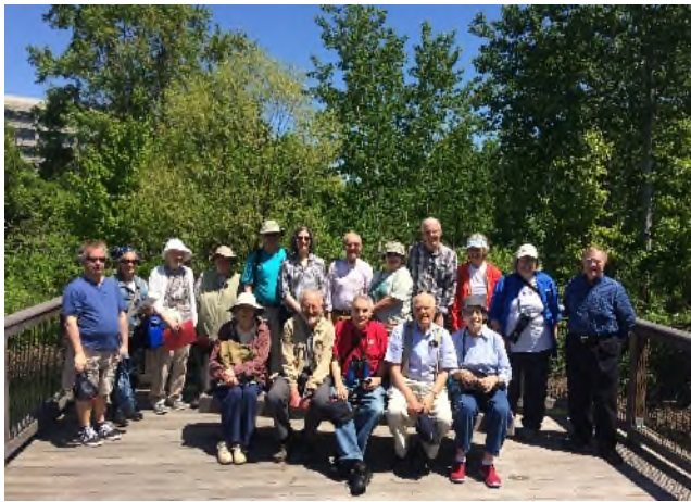
Cambridge Neighbors walk through Alewife Reservation in May.

Our walks have become so popular that we are adding more for the summer months! In addition to our Friday walks that explore all of Greater Boston, we'll have shorter walks at Danehy Park in Cambridge. These leisurely walks will be about 30 minutes long and are a great opportunity to get outside and meet new people. All walks are free and open to members and their guests.