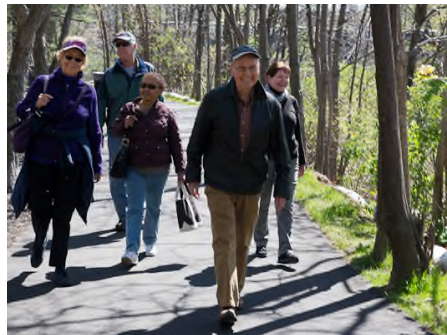
CAH members enjoy a walk along the Charles River in Watertown last spring.

As a member of the Cambridge at Home community, we value your personal wellness and are committed to helping you stay healthier, more active and more confident in your abilities to enjoy life to the fullest. No matter your current health status, we believe that nourishing the mind, body, and spirit can contribute to your overall wellbeing. We have and will continue to develop programs that contribute to a holistic approach to aging in place. This month we have several activities that we hope you will participate in: