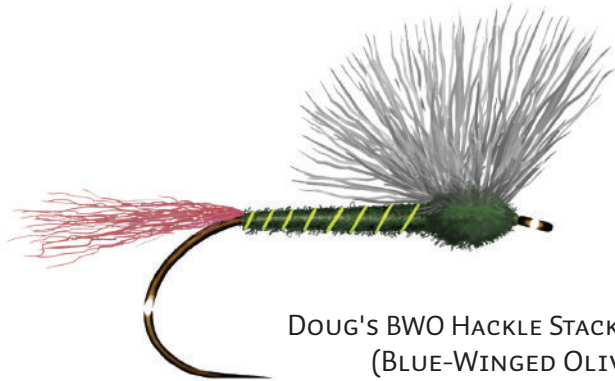
DOUG'S BWO HACKLE STACKER (BLUE-WINGED OLIVE)