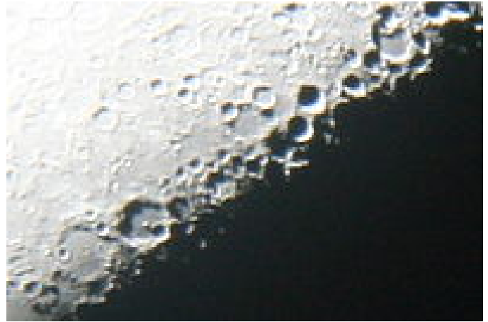
Lunar X.

The Lunar X (also known as the Werner X or the Purbach Cross) is an effect of light and shadow that creates the appearance of the letter 'X' about 6 hours before the first quarter and 6 hours after the last quarter moon. It is formed by the rims of Blanchinus, La Caille, and Purbach craters. It lasts for only a few hours, but the X will appear to float just beyond the terminator for about an hour.