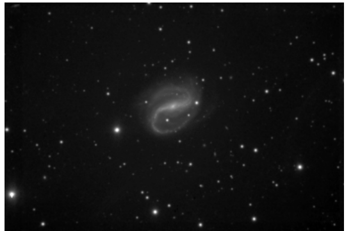
Fort Lewis (CO) College Observatory 16" Schmidt Cassegrain (www.ftlewis.edu)

NGC 7479 (the 44th entry in Patrick Moore's Caldwell Catalog) is a barred spiral galaxy located in the southwest corner of Pegasus. The accompanying finder chart shows its location about 2 1/2 degrees south of the 2nd magnitude star Markab. It was discovered in 1784 by William Herschel, who described it as "Considerably bright, much extended, gradually brighter in the middle, 4' long and 2' broad." NGC 7479 presents us with a pair of challenges. What is the smallest telescope that can capture the galaxy, and what is the least aperture that will reveal its barred structure? In modern times, NGC 7479 has spawned two supernovae – SN 1990U and SN 2009jf. This huge barred spiral