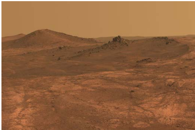
Rock Spire in 'Spirit of St. Louis Crater' on Mars. PIA19393.