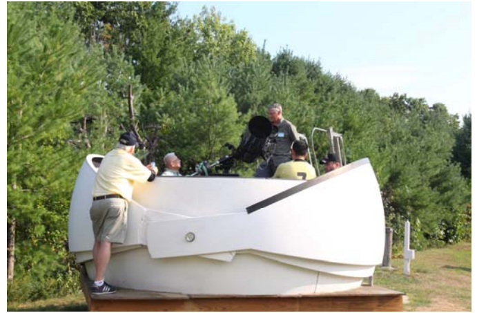
The Clamshell Observatory *