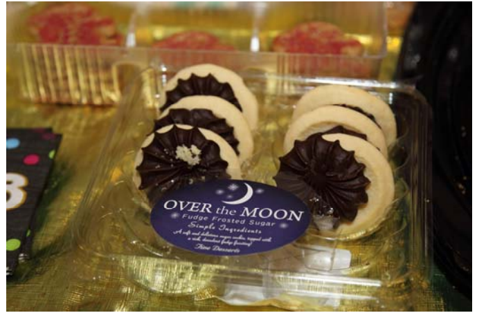
Desserts were "Over the Moon" *