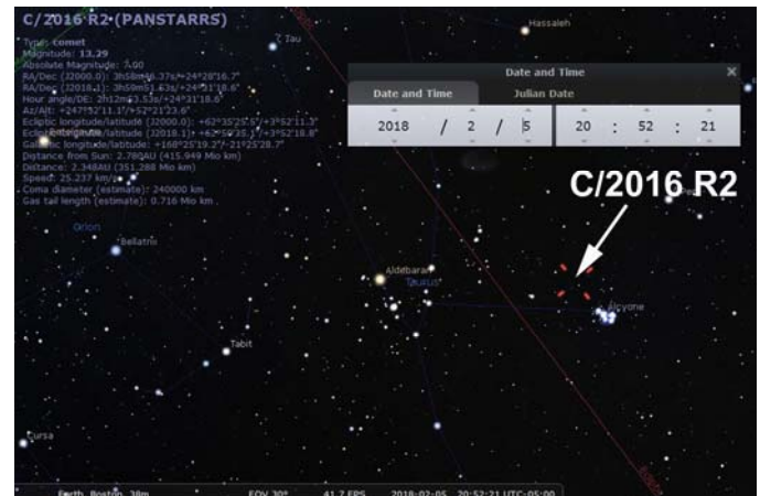
Comet C/2016 R2 in Taurus.

Comet C/2016 R2 (PANSTARRS Sky Survey comet) will be within 2 - 3 degrees East of the Pleiades open cluster (M45) in the constellation of Taurus during the first half of February. The faint comet will be a round, diffuse glow at around 10th or 11th magnitude. It should be visible under dark skies with a 5 or 6-inch telescope.