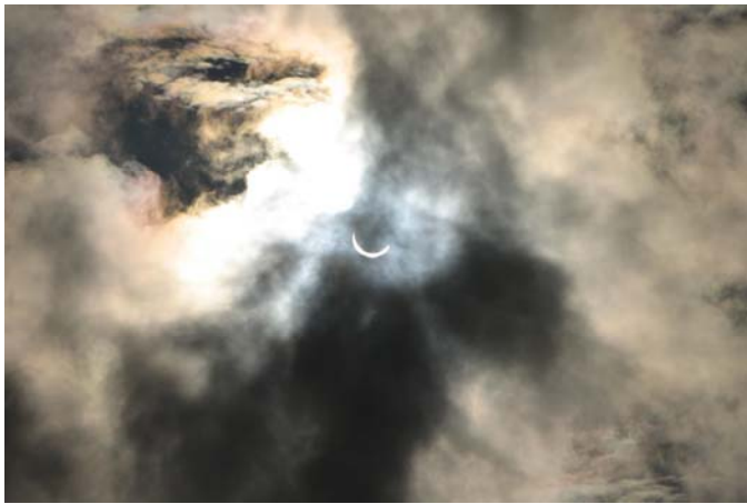
The crescent Sun filtered only by the clouds.

The forecast for the entire week of March 6 indicated thunderstorms and I was reluctant to journey to Indonesia for what sounded like a very long shot. But the trip had been paid for, so I flew 23,200 miles in 3 days to spend 3 days on land for a 2 minute 4.4 second total solar eclipse on March 9. I decided to stick to a visual experience and took no gear with me except for my trusty old Canon S2 IS point-and-shoot.