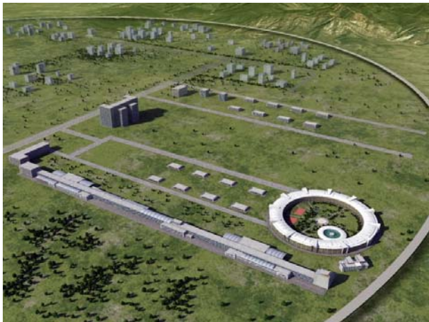
Proposed Circular Electron Positron Collider (CEPC)