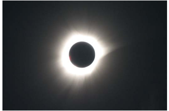
Totality and Corona.

I didn't care to tour the islands before the event (4 hotels and 5 flights in 6 days) and joined the group only for their last 2 days, to be spent on Bangka Island off Sumatra. We were based in Pangkal Pinang, just north of the track of totality. Under partly clear skies we drove south to Penyak Beach at 3:30 am, for the eclipse beginning at 6:21 am. Half of the island's population was along that stretch, it seemed! Clouds rolled in on cue and first contact was obscured, but when all hope of viewing totality appeared lost, a Hollywood script took over. About 5 minutes before totality, at 7:22 am, a hole opened up in the overcast that lasted some 10 minutes. It was magical.