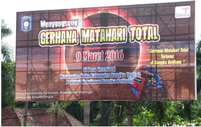
A billboard at the airport announcing the eclipse.

The forecast for the entire week of March 6 indicated thunderstorms and I was reluctant to journey to Indonesia for what sounded like a very long shot. But the trip had been paid for, so I flew 23,200 miles in 3 days to spend 3 days on land for a 2 minute 4.4 second total solar eclipse on March 9. I decided to stick to a visual experience and took no gear with me except for my trusty old Canon S2 IS point-and-shoot.