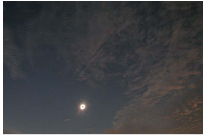
Totality with Mercury and Venus to the right and above.