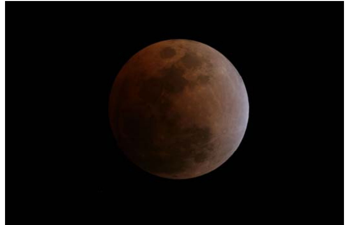
Lunar Eclipse. February 21, 2008, ATMoB Clubhouse.

Starting on Sunday evening, September 27th, we will have the privilege of observing a total lunar eclipse. The full moon will also be at perigee so this event will also allow us to see a "Super Moon Lunar Eclipse".