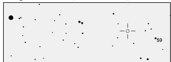
Finder Chart B. (AAVSO)

The accompanying finder charts point the way to S Cephei. A line from gamma ( \gamma ) to the wide pair rho ( \rho ) and 28 Cephei and extended an equal distance beyond brings you to a triangle of 7th magnitude stars perched atop a 6th magnitude star labeled 59 (its magnitude without decimals) on Chart B. Chart C will help you star-hop from the triangle to S Cephei. Magnitudes of surrounding stars are added (decimals omitted).