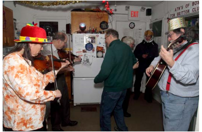
Music and dancing in the kitchen. *