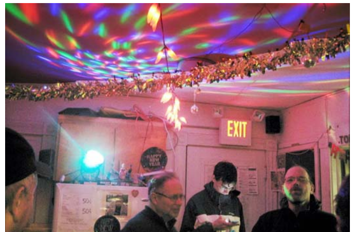
The ATMoB Nightclub.