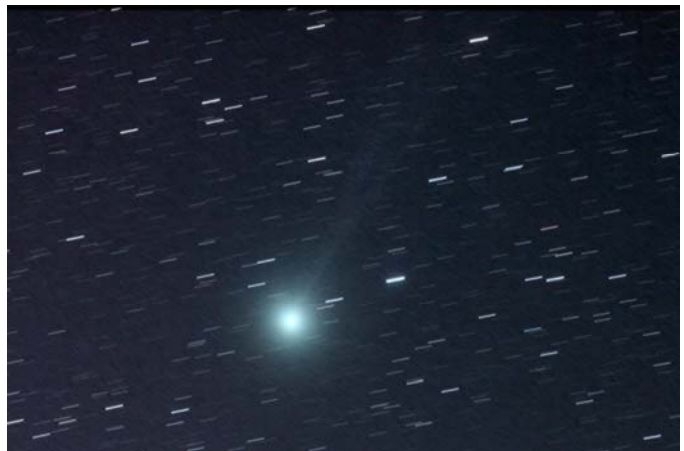
Comet Lovejoy (C/2014 Q2), 12/26/2014 *