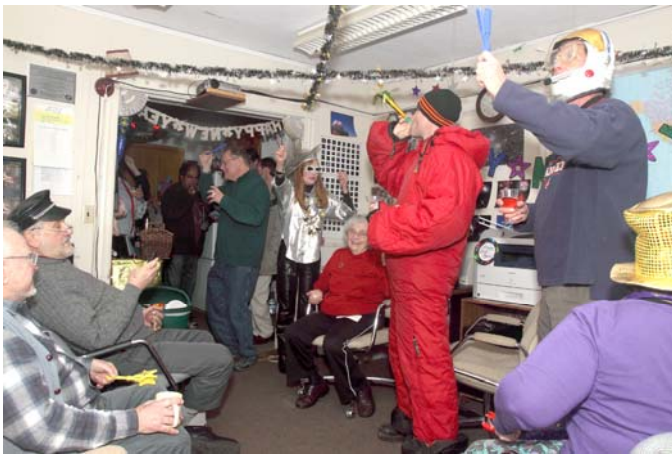
Happy New Year. 2015!!! *

There were many interesting conversations going on. Topics were telescope construction plans, optics, cooking, requests for dancing lessons, medical devices, astrophotography techniques, latest equipment purchases, photos of grandchildren, etc.