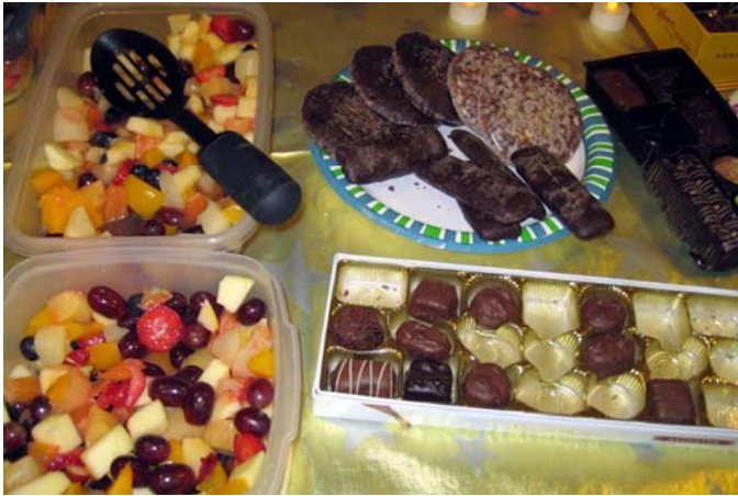
Irresistible desserts!!!

The food was great! The desserts were hard to resist! We all had to try a taste of everything! Thank you to everyone who brought all of those tasty treats!