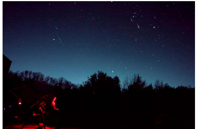
Geminid meteor over the Clamshell Observatory. *

The excellent sky conditions allowed us to see at least a dozen meteors per hour. Most people observed the Geminids near the horizon rather than overhead near the radiant. The record is held by Cheryl Rayner who recorded 63 meteors that night.