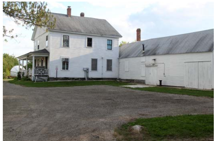
The Clubhouse parking area filled with packer material. No more mud! *

The next work party is scheduled for June 14, 2014 starting at 10 am. Repair of the field outlet boxes damaged during the winter, installation of a new mount in the clamshell observatory and continued repair of the evaporator room floor are in need of your help. Please join us.