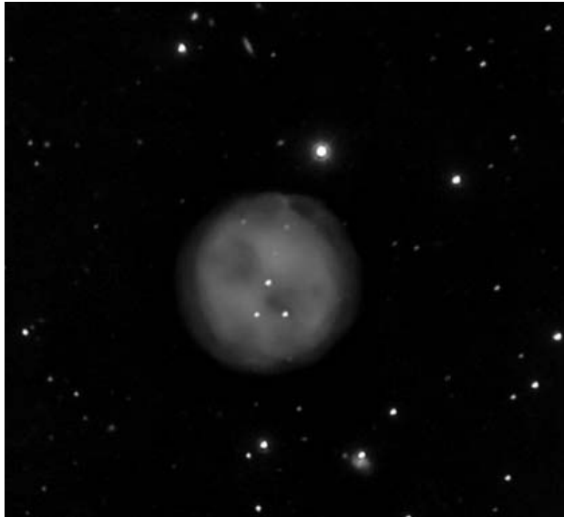
M97

In 1848, Irish astronomer William Parsons, the 3rd Earl of Rosse, studied M97 with his colossal 72-inch reflecting telescope (the "Leviathan of Parsonstown"). He noted and sketched a pair of dark circular areas within the nebulosity that gave M97 the appearance of an owl's head, hence its modern-day nick-name the "Owl Nebula." Fortunately, you won't need Parson's Leviathan to see the Owl eyes. With patience and a magnification of 138X, I once captured fleeting glimpses with a 10-inch reflector. The limiting magnitude that night was about 5. From a dark-sky site, a smaller scope should be able to do the trick.