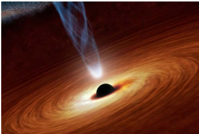
Artist Conception of a Black Hole.