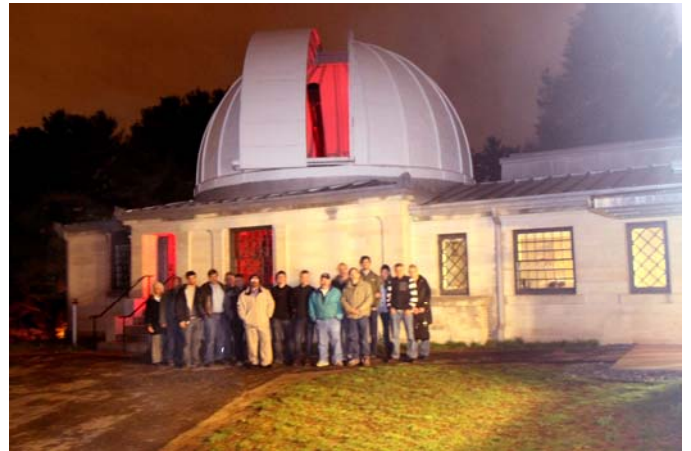
Some ATMoB members posing in front of the 12-inch dome. *