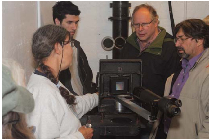
Hale spectrohelioscope. *

The Hale spectrohelioscope, installed in 1934. Sunlight, directed by a heliostat housed in a small aluminum dome on the roof, beams down through a vertical brass tube to the instrument in the basement. More than one person was overheard announcing appreciatively "This is going to be my next project."