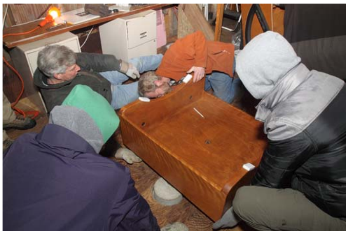
Reinstalling the 25-inch base after adding the new footings.*

The weekly Thursday evening mirror grinding (except for 2nd Thursday meeting at Harvard), the Friday night Astro class and Saturday night observing continued this month.