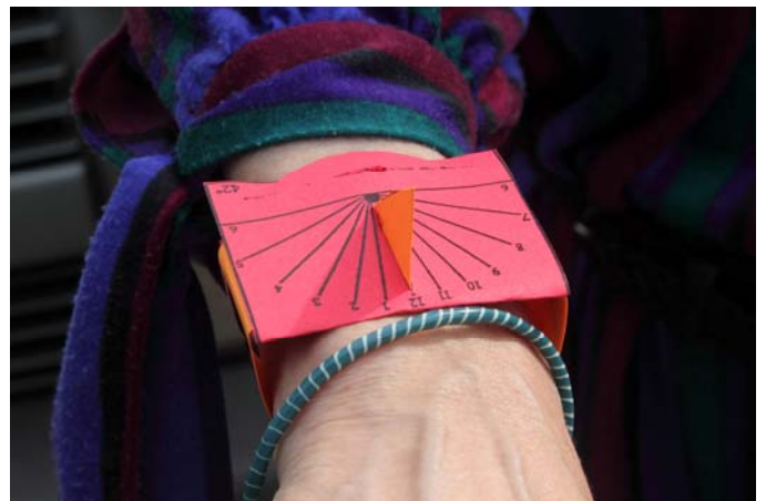
Sundial wristwatch. *