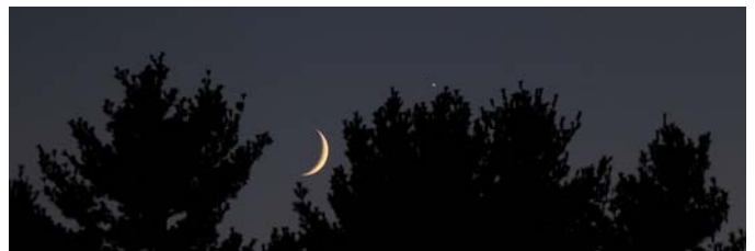
Moon and Venus at the Clubhouse. 9 September 2013. *