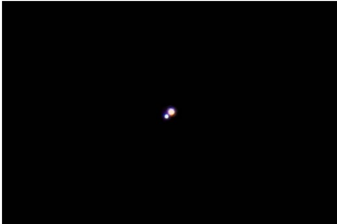
Almach ( \gamma Andromeda)-Takahashi FS128

Parking at the CfA is allowed for the duration of the meeting