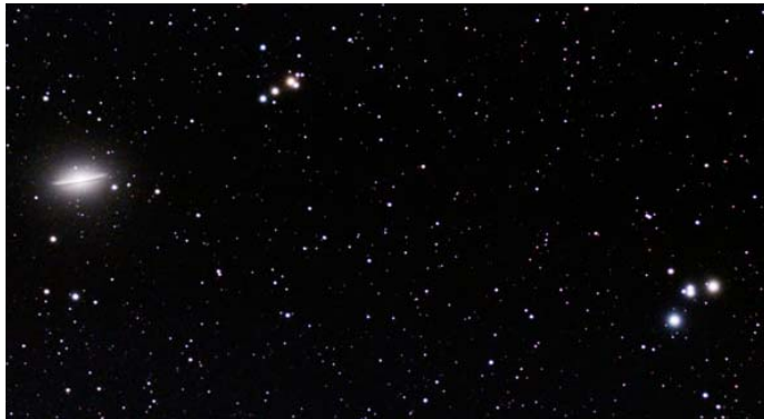
(L to R) M104, Jaws, Stargate

Your comments on this column are welcome. E-mail me at gchapple@hotmail.com .