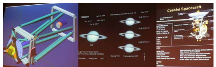
(L-R) Relay scope, Saturn and the Cassini Spacecraft