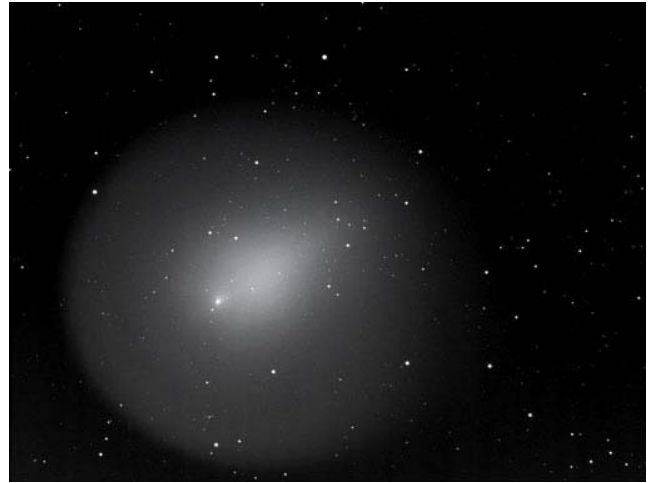
2007Nov.11 – FS128, ST-2000XCM, 10 subs x 30 sec (John Blomquist)