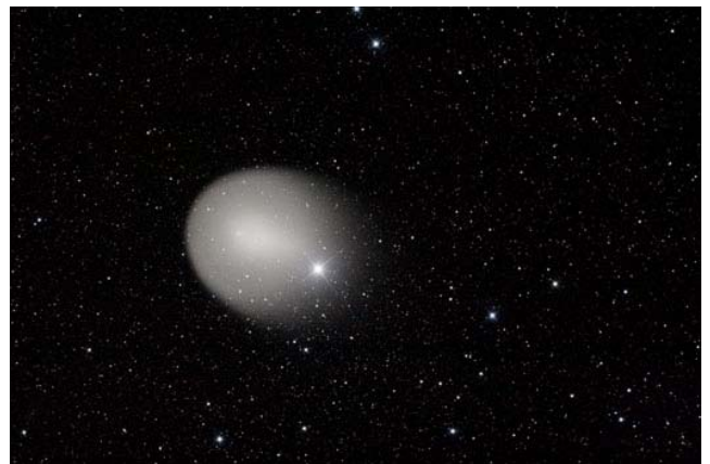
2007Nov.18 – Tak E-180 f/2.8, Canon 20D, 20 subs x 15 sec The bright star in the coma is Mirfak, in Perseus.