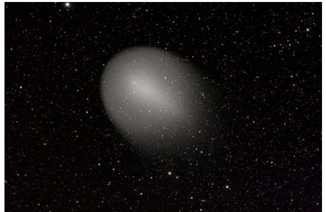
2007Dec.1 – Tak E-180 f/2.8, Canon 20D, 7 subs x 30 sec