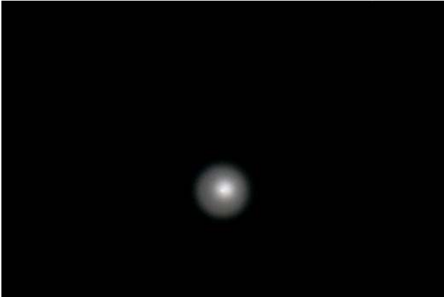
2007Oct.25 – C-8 f/11 prime, Canon 20D. 20 sec Imaged at the Locke Middle School Star Party

I am sure many of you have been tracking the progress of Comet Holmes/17P. It burst from its 17 magnitude obscurity to a naked eye object in a matter of hours in October. The following is a small number of images that members have taken of this unique comet. The images are not shown at the same scale because they were taken through different telescopes.