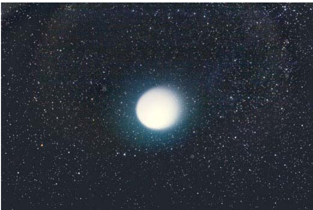
2007Nov.6 – Tak E180, 17 subs x 30 sec (Al Takeda) Notice the ion tail going off to the right in this heavily processed image.