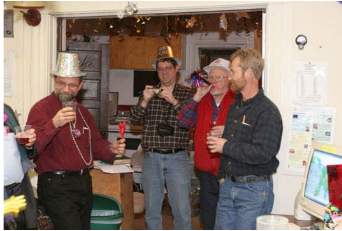
2007 New Year's Eve Revelers