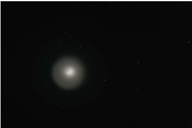
2007Oct28 – C-9 /f11 , Canon 400D, 10 subs x 20 sec. The nucleus is the left dot in the coma, the right dot is GSC 3334 784.