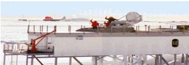
Antarctic Submillimeter Telescope and Remote Observatory

Parking at CfA is allowed for duration of meeting