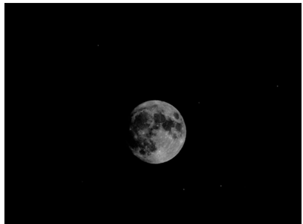
Moon – Canon G1, 3.3 Megapixel, afocal with a 8.5x44 binoculars on a tripod, 1/250 th sec, f/8, ISO 400, April 30, 2007.

A follow-up to the class "Getting Started in Astrophotography" will be announced soon. The attendees from the 1 st session will be contacted by email to schedule an imaging session at the Clubhouse.