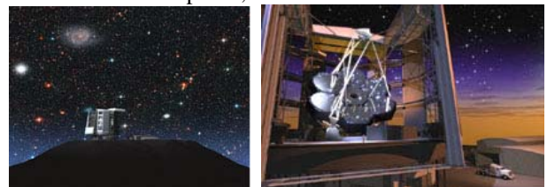
Giant Magellan Telescope - Carnegie Observatories.

The telescope completion date is tentatively set for 2016 and they hope to site it at Las Campanas, Chile.