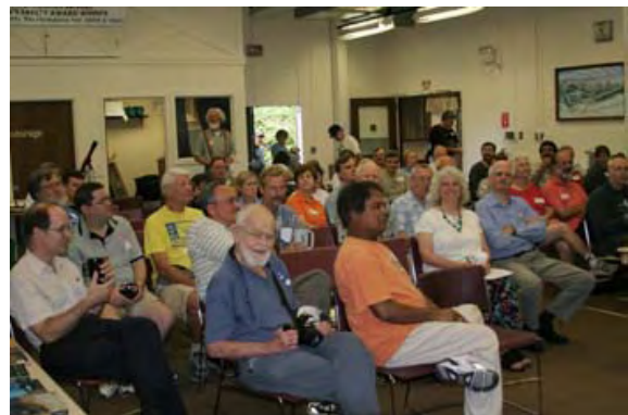
ATMoB Members at the Conjunction