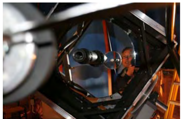
32" Primary, Mangin Secondary and Relay Optics